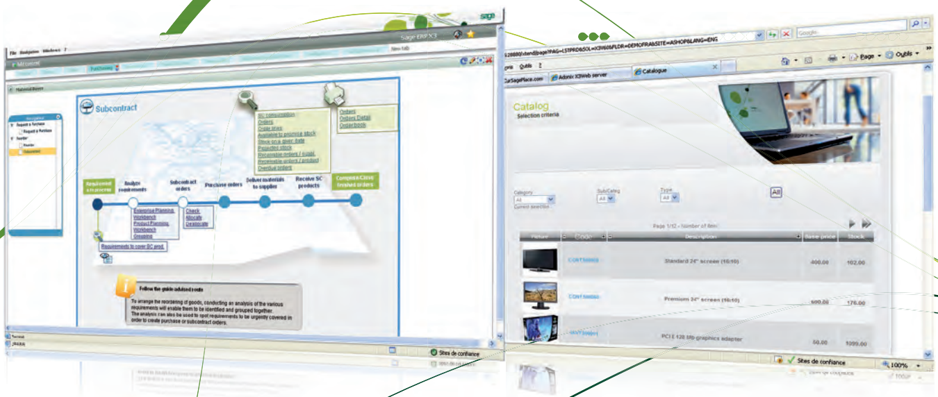
This screen illustrates a sub-contract management process.

End Users: • User interfaces • Role-based concepts • Personalization • Collaboration features • Ease of use • More integrated analytics features • Occasionally access an ERP system